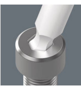
The spherical drive profile means that it is possible to swivel the axis of the tool to that of the screw, and therefore enable angled, "around-the-corner" screwdriving jobs.