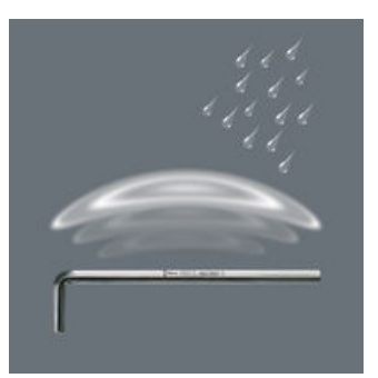
Chrome-plated hexagon L-keys for outstanding surface protection and long service life. High corrosion protection.