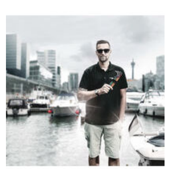
We questioned the classic L-key design, since all too often the screw head recess is rounded out, meaning screws can no longer be tightened or loosened - and so the user finds the L-key slipping out of the recess. Wera Hex-Plus tools have a larger contact surface in the screw head. The notching effects are reduced and thereby the deformation of the screws. At the same time, as much as 20 % more torque can be applied.