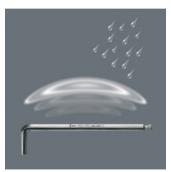
Chrome-plated hexagon L-keys for outstanding surface protection and long service life. High corrosion protection.