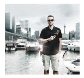
We questioned the classic L-key design, since all too often the screw head recess is rounded out, meaning screws can no longer be tightened or loosened - and so the user finds the L-key slipping out of the recess. Wera Hex-Plus tools have a larger contact surface in the screw head. The notching effects are reduced and thereby the deformation of the screws. At the same time, as much as 20 %more torque can be applied.