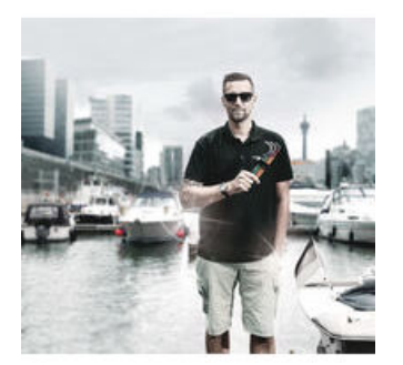
We questioned the classic L-key design, since all too often the screw head recess is rounded out, meaning screws can no longer be tightened or loosened - and so the user finds the L-key slipping out of the recess. Wera Hex-Plus tools have a larger contact surface in the screw head. The notching effects are reduced and thereby the deformation of the screws. At the same time, as much as 20 % more torque can be applied.