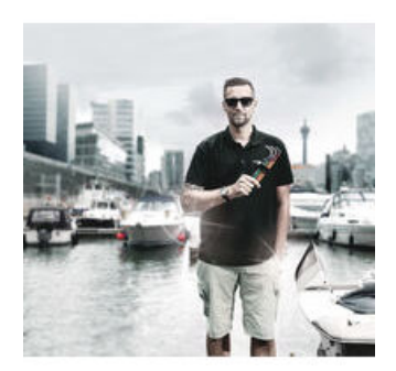
We questioned the classic L-key design, since all too often the screw head recess is rounded out, meaning screws can no longer be tightened or loosened - and so the user finds the L-key slipping out of the recess. Wera Hex-Plus tools have a larger contact surface in the screw head. The notching effects are reduced and thereby the deformation of the screws. At the same time, as much as 20 % more torque can be applied.

Further versions in this product family: