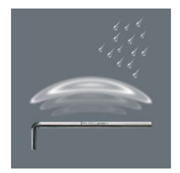
Chrome-plated hexagon L-keys for outstanding surface protection and long service life. High corrosion protection.