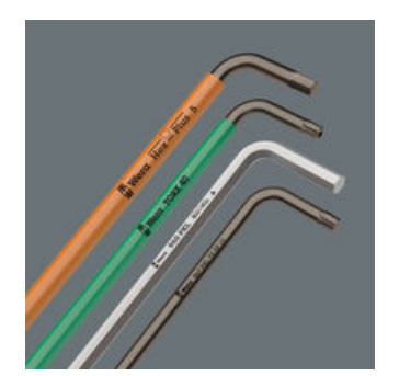
The size of each L-keys has been engraved by a laser. In addition Take it easy L-keys have a colour coding according to sizes - for simple and rapid accessing of the required tool. Making it easy to find the right tool.

Hexagon screws can endure a problem because the contact surfaces delivering the power from conventional the tool, is transferred to the screw via very small surface areas. The consequence: the screw can become damaged (rounding out). Hex-Plus tools have a greater contact surface that prevents this from happening! At the same time, as much as 20 % more torque can be applied. Good to know: Hex-Plus tools fit into every standard hexagon socket screw!