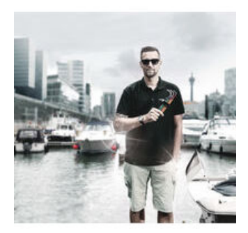
We questioned the classic L-key design, since all too often the screw head recess is rounded out, meaning screws can no longer be tightened or loosened - and so the user finds the L-key slipping out of the recess. Wera Hex-Plus tools have a larger contact surface in the screw head. The notching effects are reduced and thereby the deformation of the screws. At the same time, as much as 20 % more torque can be applied.