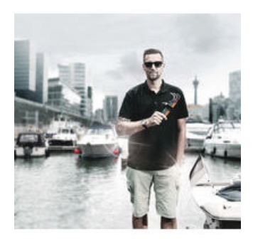
We questioned the classic L-key design, since all too often the screw head recess is rounded out, meaning screws can no longer be tightened or loosened - and so the user finds the L-key slipping out of the recess. Wera Hex-Plus tools have a larger contact surface in the screw head. The notching effects are reduced and thereby the deformation of the screws. At the same time, as much as 20 % more torque can be applied.