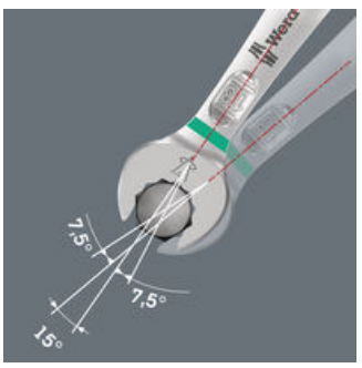
Joker 6003: For return angles of less than 30°

Thanks to the open end side offset by 7.5°, double hexagon geometry and an adjusted application method (placement - screwdriving - turning - replacement - screwdriving - turning, etc), even screwdriving challenges allowing a return angle of less than 30° can be solved.