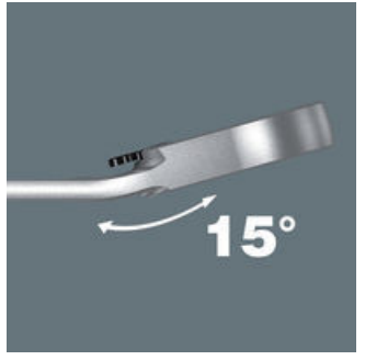
The ratchet end is tilted at 15° to the tool axis, making application of the tool in confined spaces much easier.