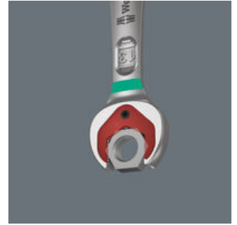
Ring ratchet spanner Joker 6000

The Joker's holding function means that nuts and bolts can be held in the jaw and easily positioned where they are needed. Fastening on to the thread can then be done quickly and safely, thanks to the innovative special stop-plate which holds the fastener. No more time-wasting searches for dropped nuts and bolts! After applying and positioning the nut or bolt, fastening can begin immediately - no additional tools required.