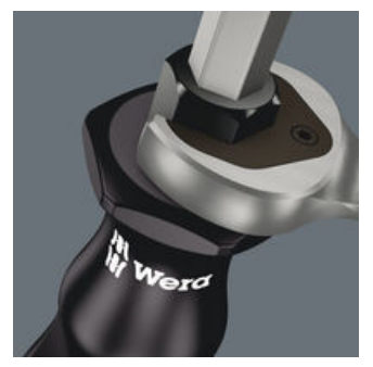
Greater torque can be transferred by fitting an open-jaw or ring spanner over the integrated hex bolster.