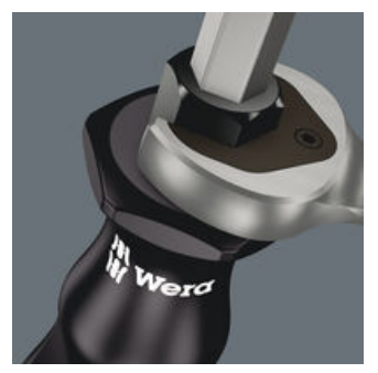
Greater torque can be transferred by fitting an open-jaw or ring spanner over the integrated hex bolster.