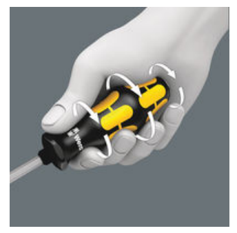
The hard materials used for the handle ensure rapid hand repositioning without any danger of the skin "sticking" to the handle. The surrounding hard zones with large diameters glide like wheels through the hand.

The basic idea for the prototype of the Kraftform handle - that the hand should dictate the design has, right through to today, proved to be correct. In cooperation with the internationally recognised Fraunhofer IAO Institute, Wera developed a screwdriver handle designed to match the shape of the human hand as long ago as the 1960s. After a long development phase, the Wera Kraftform handle was launched to the market in 1968. It has been optimised through the years with new technologies, but has kept its proven shape. After all, the human hand has not changed either.