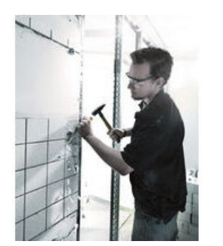
Screwdrivers are often misused as chisels. This can be dangerous. The chiseldriver is the solution when not only screwdriving is required. For fastening, chiselling and loosening seized screws. Wera chiseldriver: the screwdriver whenever the going gets tough!