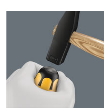
integrated impact An cap lengthens the service life and reduces the danger of splintering. Nevertheless, always wear protective goggles.