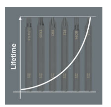
The Wera impact screwdriver bits are particularly suitable for use with the Wera 921 impact screwdriver.