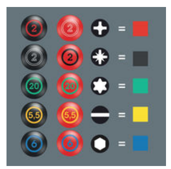
Screwdrivers with "Take it easy" tool finder: colour coding according to profile and size stamp.