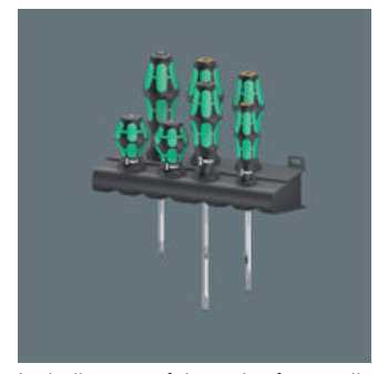
Including useful rack for wellarranged storage of the screwdrivers.