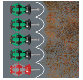
The special surface treatment of the blades sees to a high level of corrosion protection and optimum fitting accuracy of the screw.