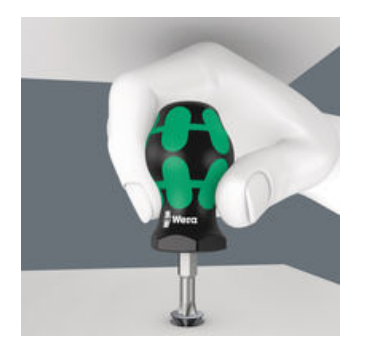
With its compact handle shape and the short blade, the Kraftform Stubbies are particularly suitable for working in confined screwdriving situations.