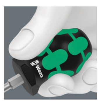
The 2-component Kraftform handle allows high power transmission due to the non-slip, softer grip areas and high working speeds due to the hard grip areas, which allow a quick hand switch.