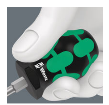
The 2-component Kraftform handle allows high power transmission due to the non-slip, softer grip areas and high working speeds due to the hard grip areas, which allow a quick hand switch.