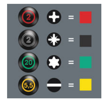
Screwdrivers with "Take it easy" tool finder: colour coding according to profile and size stamp.