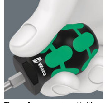
The 2-component Kraftform handle allows high power transmission due to the non-slip, softer grip areas and high working speeds due to the hard grip areas, which allow a quick hand switch.