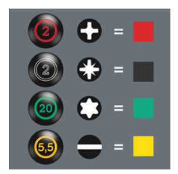
Screwdrivers with "Take it easy" tool finder: colour coding according to profile and size stamp.