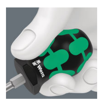
The 2-component Kraftform handle allows high power transmission due to the non-slip, softer grip areas and high working speeds due to the hard grip areas, which allow a quick hand switch.