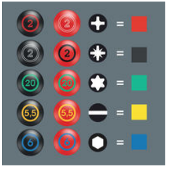
Screwdrivers with "Take it easy" tool finder: colour coding according to profile and size stamp.