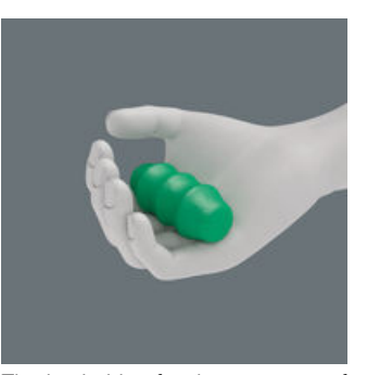
The basic idea for the prototype of the Kraftform handle - that the hand should dictate the design has, right through to today, proved to be correct. In cooperation with the internationally recognised Fraunhofer IAO Institute, Wera developed a screwdriver handle designed to match the shape of the human hand as long ago as the 1960s. After a long development phase, the Wera Kraftform handle was launched to the market in 1968. It has been optimised through the years with new technologies, but has kept its proven shape. After all, the human hand has not changed either.