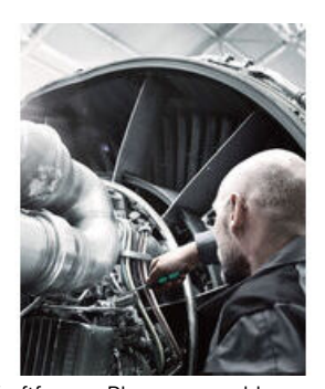
Kraftform Plus screwdrivers ergonomics you can grasp. They relieve the entire hand-arm system even when used intensively. Along with other technical and product advantages such as the Lasertip for a secure fit in the screw head, Kraftform screwdrivers are the ideal choice whenever manual screwdriving jobs are concerned.