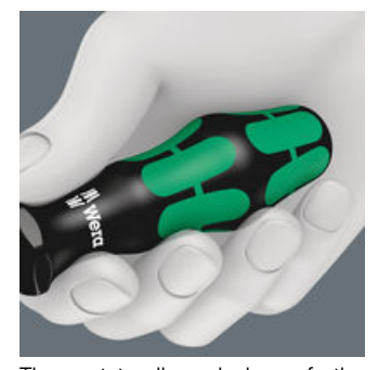
The outstanding design of the Kraftform handle that fits perfectly into the hand prevents hand injuries such as blisters and calluses.