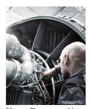
Kraftform Plus screwdrivers ergonomics you can grasp. They relieve the entire hand-arm system even when used intensively. Along with other technical and product advantages such as the Lasertip for a secure fit in the screw head, Kraftform screwdrivers are the ideal choice whenever manual screwdriving jobs are concerned.