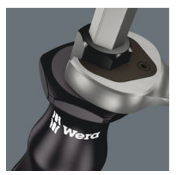
Hexagonal blade and bolster for higher torque transfer.

Further versions in this product family: