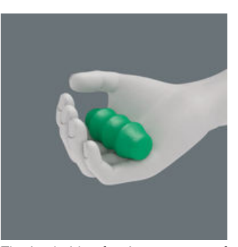
The basic idea for the prototype of the Kraftform handle - that the hand should dictate the design has, right through to today, proved to be correct. In cooperation with the internationally recognised Fraunhofer IAO Institute, Wera developed a screwdriver handle designed to match the shape of the human hand as long ago as the 1960s. After a long development phase, the Wera Kraftform handle was launched to the market in 1968. It has been optimised through the years with new technologies, but has kept its proven shape. After all, the human hand has not changed either.

Further versions in this product family: