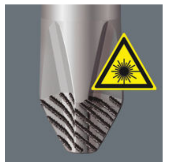
A precisely-focused laser creates a sharp-edged surface structure. Wera Lasertip "bites" itself into the screw head and prevents any slips out of the recess. It is available for screwdrivers for slotted, Phillips and Pozidriv screws.

It happens time and time again that the tip slips out of the screw head when screwdriving, sometimes damaging valuable surfaces or even causing injury. The tips of the Wera Lasertip screwdrivers are microscopically roughened by means of a laser. This rough surface literally "bites" itself firmly into the screw head. Slipping out becomes a thing of the past.