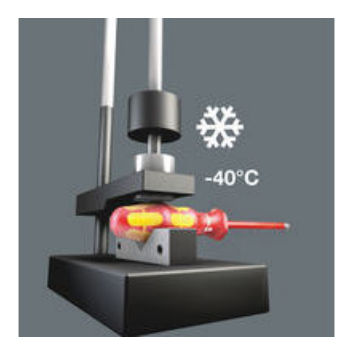
Impact strength tested at -40°C, guaranteeing safety even under extreme conditions.