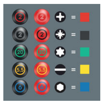
Screwdrivers with "Take it easy" tool finder: colour coding according to profile and size stamp.