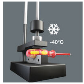
Impact strength tested at -40°C, guaranteeing safety even under extreme conditions.