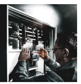
Insulated, individually tested VDE Thandle torque indicator for safe working up to 1,000V