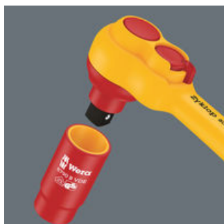
The ball lock ensures sockets and accessories fit securely, providing increased safety during operation. A short press on the release button allows the tool to be changed quickly.