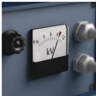
The individual testing of the Zyklop tools for electricians at 10,000 volts, in accordance with IEC 60900, guarantees safe working under voltages up to 1,000 volts.