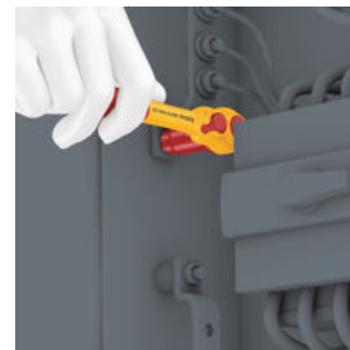
The extremely slim design of the Zyklop VDE ratchet makes it easy to work, even in confined spaces.