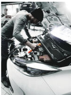
Zyklop ratchet and accessories for Electricians