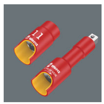
The Zyklop sockets and extensions for electricians offer increased safety thanks to their 2-component isolation with yellow insulation core under red insulation outer layer.