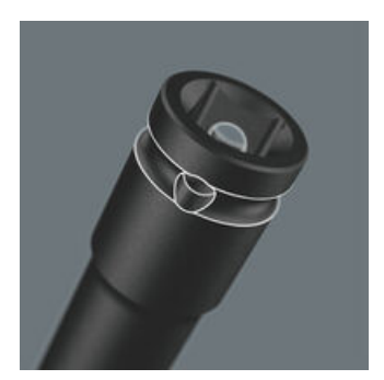
Due to the groove and the ring socket, the tool can be secured with a locking pin or O-ring on the power tool.