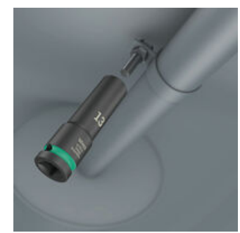
Due to the long design of the socket, screwdriving can also be achieved in small spaces. Fittings with protruding threaded rods are often also possible.