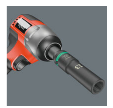
The extremely robust forged design ensures that the Impaktor sockets have an above-average service life, even under extreme conditions.