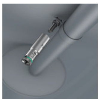
Due to the long design of the socket, screwdriving can also be achieved in small spaces. Fittings with protruding threaded rods are often also possible.