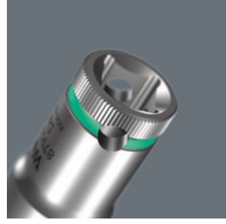
Knurling on lower end for more grip when used manually.