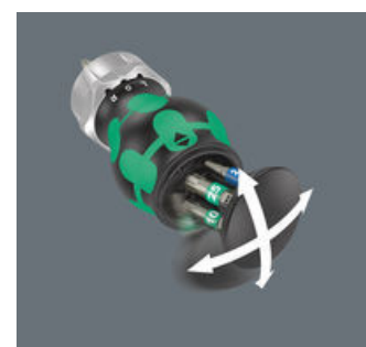
The handle can be opened and thus gives access to the six bits contained in the magazine.