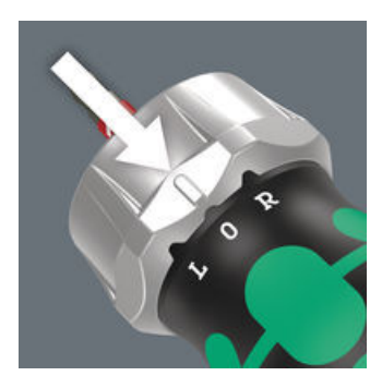
The ratchet mechanism is finetoothed for a low return angle. The screwdriving directions right/fixed/left can be set with the reversible ring. The magnetic bit mounting is suitable for bits with 1/4" external hexagon drive as per DIN ISO 1173-C 6.3 and Wera connection series 1