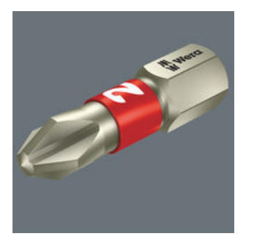
Wera stainless steel bits are manufactured out of stainless steel so unsightly rust can be avoided. The stainless steel bits from Wera are vacuum ice-hardened and have the hardness and strength needed for screw connections. There are no limitations to the industrial applications they are suitable for.