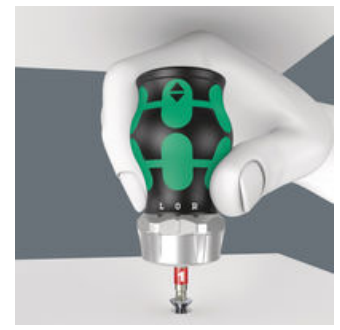
With its compact handle shape and the short blade, the Kraftform Stubbies are particularly suitable for working in confined screwdriving situations.

Stubby Ratchet Screwdriver with Bit Magazine