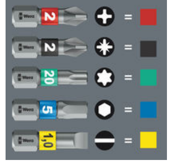
"Take it easy" tool finder with colour coding according to profiles and size stamp - for simple and rapid accessing of the required tool.