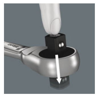
Smooth push-through mechanism, that cannot get lost.