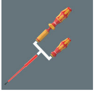
Suitable for Kraftform handles 7400 VDE, 827 T i and 817 VDE.