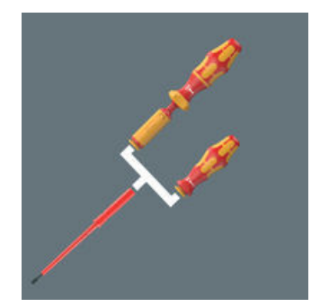
Suitable for Kraftform handles 7400 VDE, 827 T i and 817 VDE.