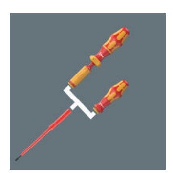
Suitable for Kraftform handles 7400 VDE, 827 T i and 817 VDE .