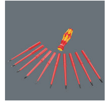
The handle/interchangeable blade system allows rapid exchange of the blades required for a wide range of applications.