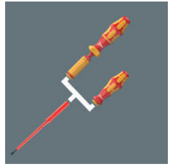
Suitable for Kraftform handles 7400 VDE, 827 T i and 817 VDE .