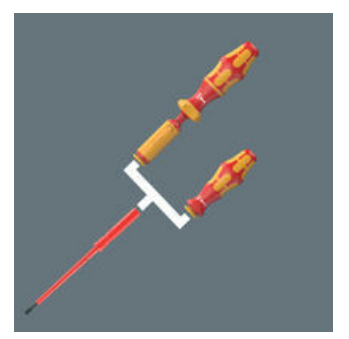
Suitable for Kraftform handles 7400 VDE, 827 T i and 817 VDE.