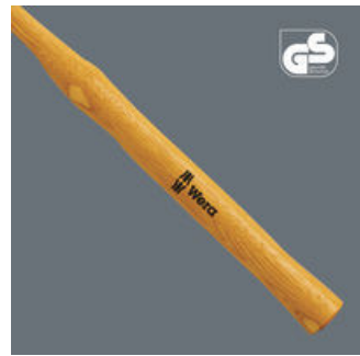
Powerful work is ensured with handles out of high quality ash wood.