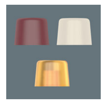
Versatile use thanks to the soft faced heads that can be retrospectively fitted.