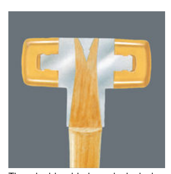
The double-sided conical design creates an unbreakable and secure link between the handle and head of the hammer.