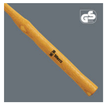
Powerful work is ensured with handles out of high quality ash wood.