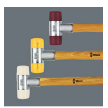
They come in soft, medium and hard designs for a wide range of applications from universal use to splinter-free applications on sharpedged work pieces.