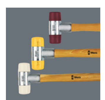
They come in soft, medium and hard designs for a wide range of applications from universal use to splinter-free applications on sharpedged work pieces.