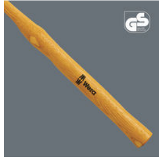
Powerful work is ensured with handles out of high quality ash wood.