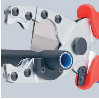
Composite pipes of 1/2" – 1" (12–25 mm) dia. are cut cleanly and without deformation