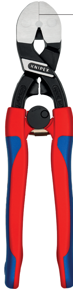
View: Back of pliers