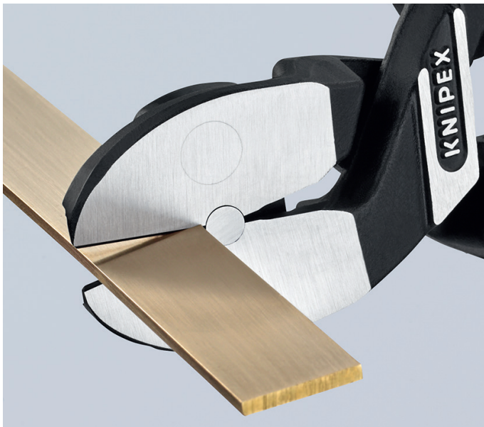
Copper busbars are cut cleanly and flush