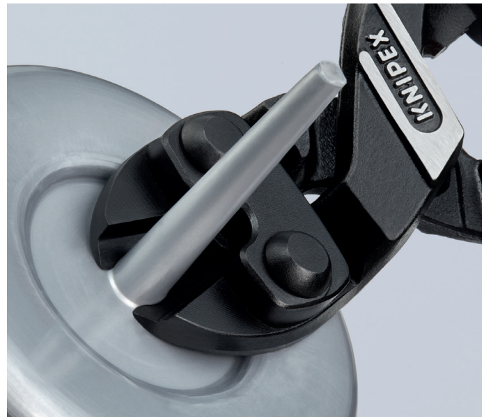
Ideal for the flush cutting of plastic sprues with large diameters