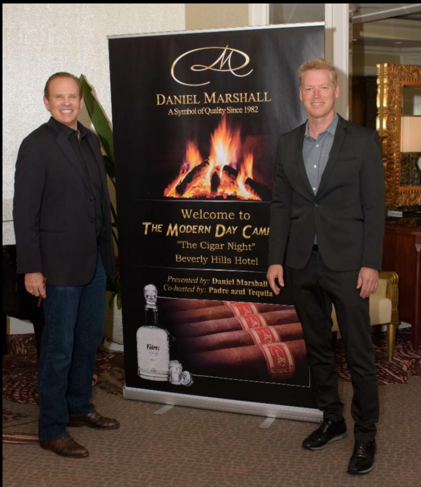
In 2012 the hotel became the first historical landmark in Beverly Hills. Its