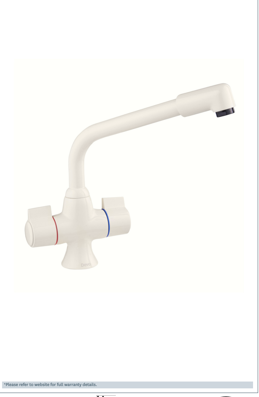
Flow (Bar - I/min, open outlet)