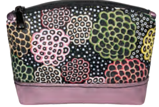
ALTERNATIVE ONE-PIECE BOTTOM