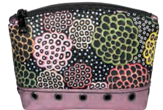
ALTERNATIVE ONE-PIECE BOTTOM - USING THE RIVET TEMPLATE WITH GROMMETS