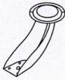
B.Leg x 2