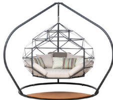
Zome + Platform