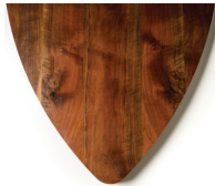
Solid Walnut Platform