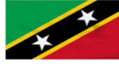
Nevis Island, West Indies